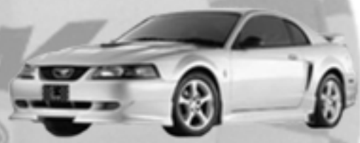
Rough Stage 1