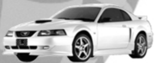
Rough Stage 2