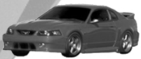
Rough Stage 3